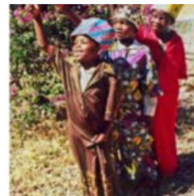
Three Wise Men