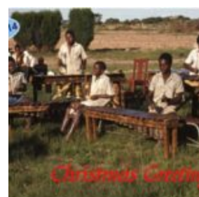
MRCH Marimba band