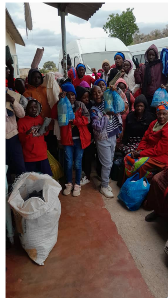
Also on 9 June, more celebrations at the Outreach Centre in Donga as children are presented with goodie bags