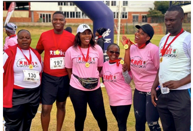
Above and below, medal-winners at the 'Run for a child' half marathon