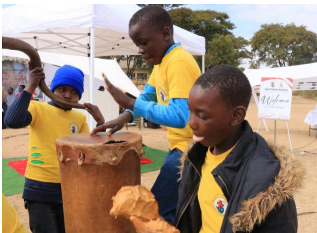
Above and right: young performers at the Matthew Rusike Big Sunday